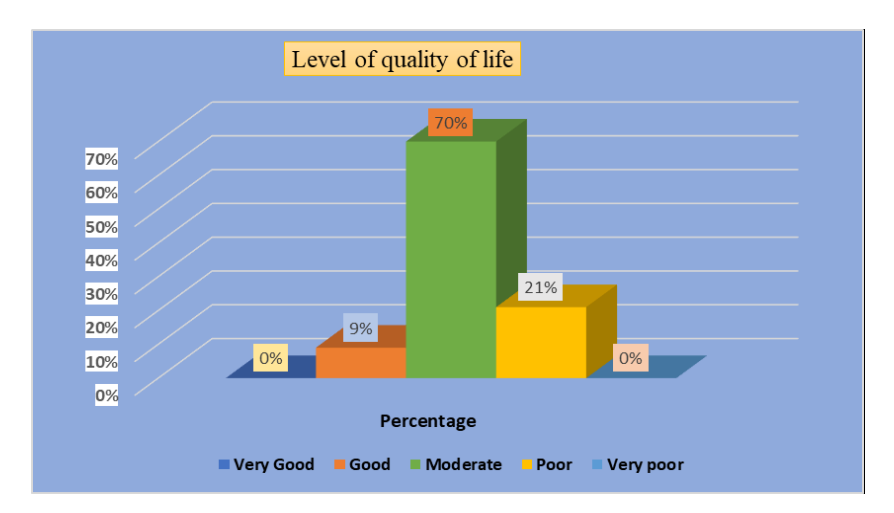
Fig. 1: Percentage-wise dispersal of QOL amongst parents of children suffering from thalassemia

of life (Fig. 1). Total 88% of parents had a moderate level of coping strategies, 08% had a good level of coping strategies and 4% had a low level of coping strategies (Fig. 2).